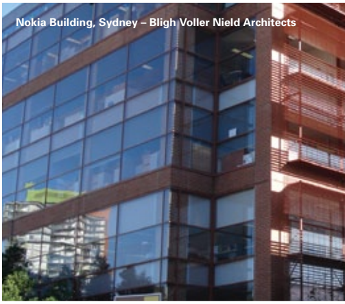
Nokia Building, Sydney – Bligh Voller Nield Architects